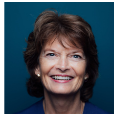
Lisa Murkowski U.S. Senator (Alaska)