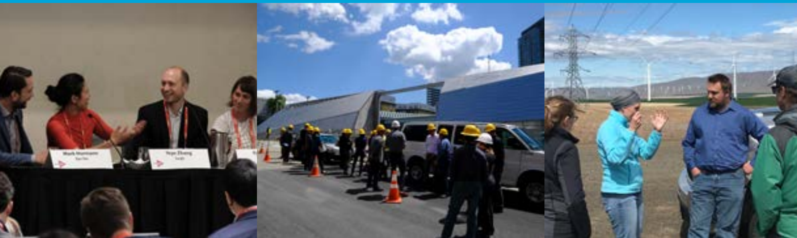
Our members and event attendees dug deep into new industry ideas and best practices at our GridFWD event, numerous grid modernization tours and our Energy Resiliency Summit.