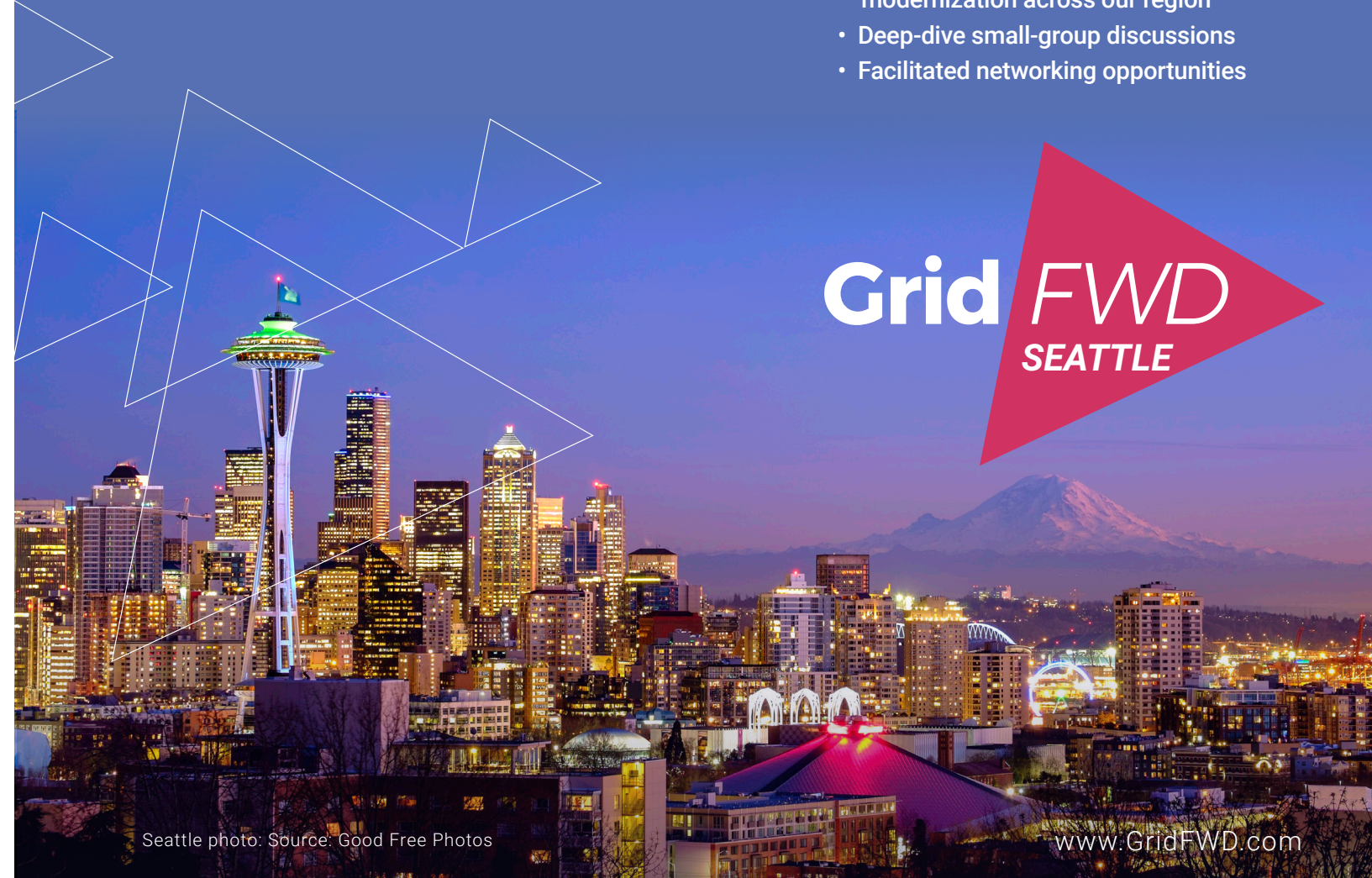
Seattle photo: Source: Good Free Photos